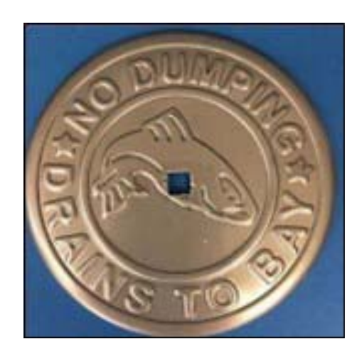
Look for this medallion on UD storm drains as a reminder for "No Dumping"